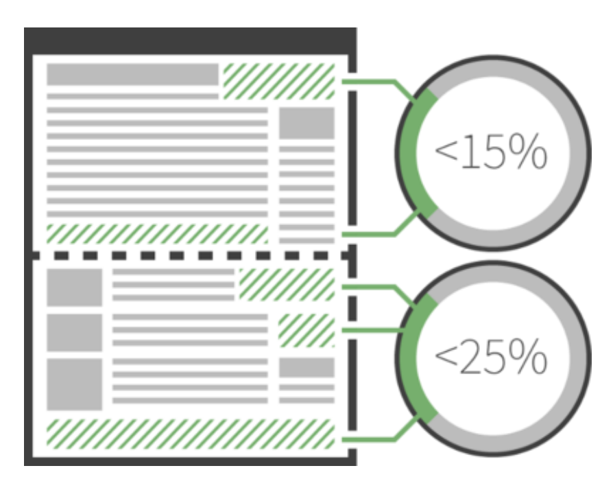
Figure 2- source : https://acceptableads.com/committee/

All ads placed above the waterline (the portion of the web page that appears first in the browser window when a page is opened, based on standard screen sizes), most occupy less than 15% of the visible portion of the web page. Ads placed below the waterline must occupy less than 25% of the visible portion of the web page.